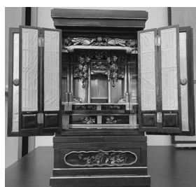
Butsudan 1 Dimensions: