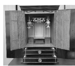
Butsudan 2 Dimensions: