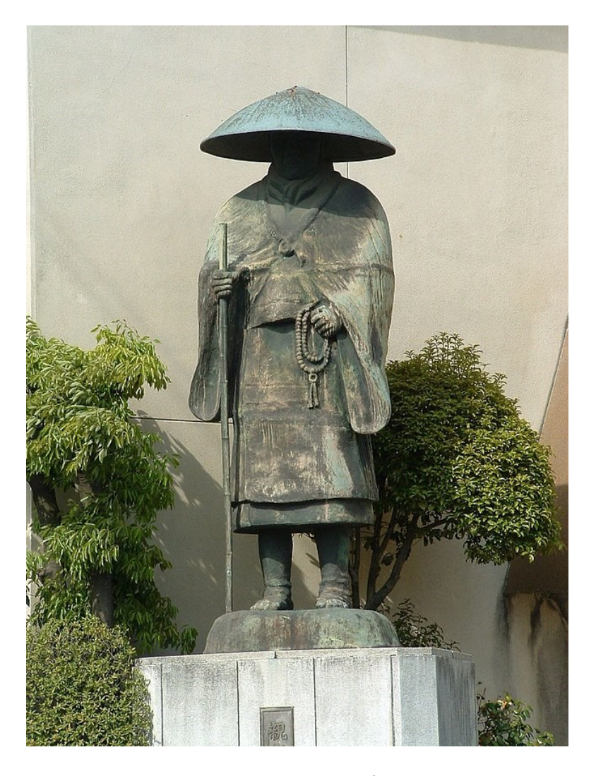
Statue of Shinran Shonin in Kyoto