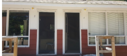
Doors to Family Memories

Office: 416-534-4302 E-mail: tbc@tbc.on.ca