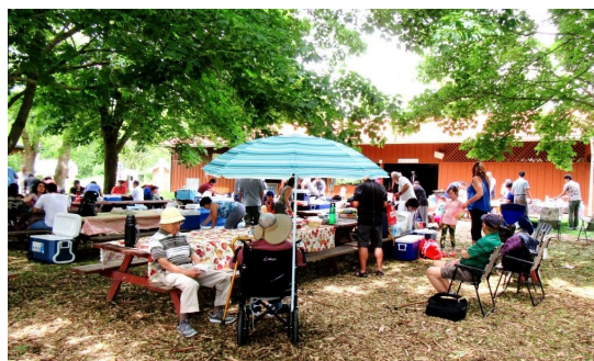
TBC Picnic at Green Acres, 2019

https://maps.app.goo.gl/YADdPAQYCxpUc8kF7