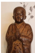
The Shosanshiki, or First Visitation

Ceremony to the Sangha, is a cherished Buddhist tradition that celebrates a child’s formal welcome into the community. Once held only for newborns, this meaningful ceremony is now open to children of all ages who wish to take their first step on the path to the truth of Amida Buddha.